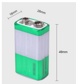
9V rechargeable Battery-Lithium Battery(Optional Accessory)