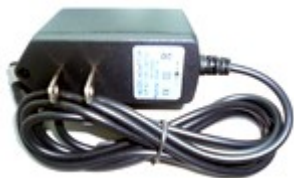
Charger (Optional Accessory)