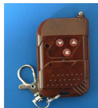
Remote Control Key