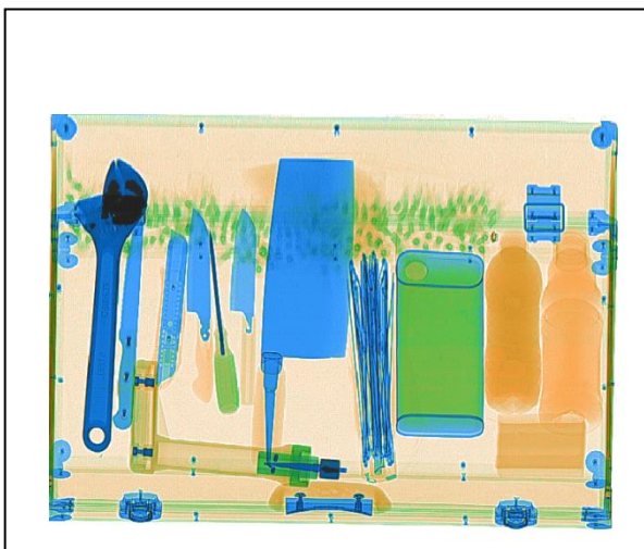
High resolution image