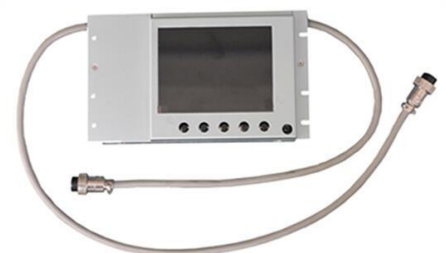
Central Control Unit