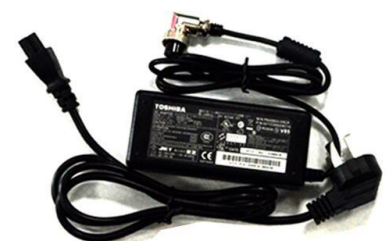
Power Supply Adapter