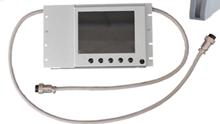
Central Control Unit