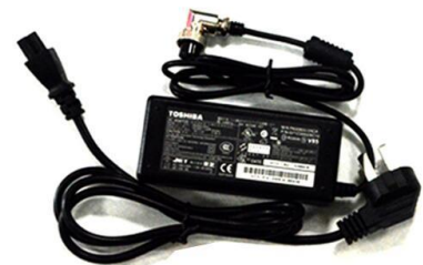
Power Supply Adapter